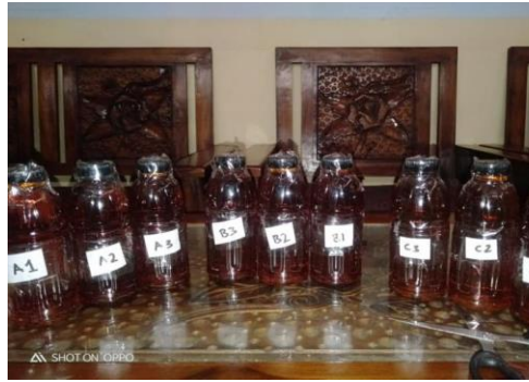
Figure 2. Sample