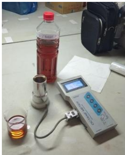
Figure 3. Testing using Cetane Number Analyzer

Based on the data obtained from the results of laboratory tests carried out, to find out the cetane number was measured using the Cetane Number Analyzer. The testing process is shown in Figure 3.